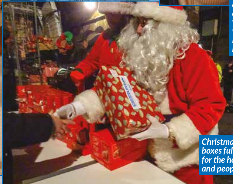
Christmas Shoe boxes full of gifts for the homeless and people in need