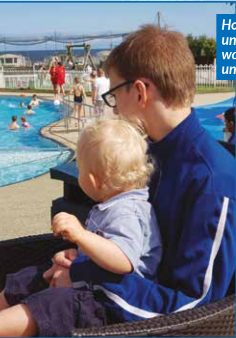
Holidays for families under stress who would otherwise be unable to go away