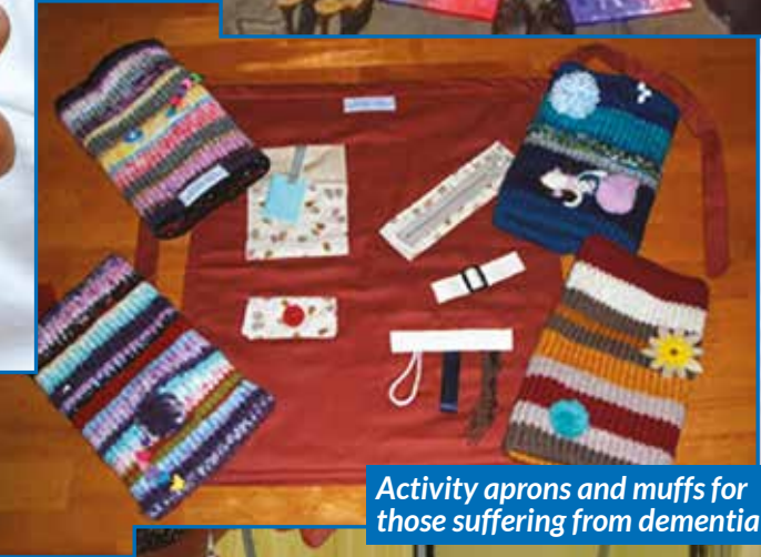
Activity aprons and muffs for those suffering from dementia