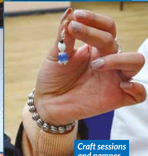
Craft sessions and pamper days for vulnerable women in hostels and refuges