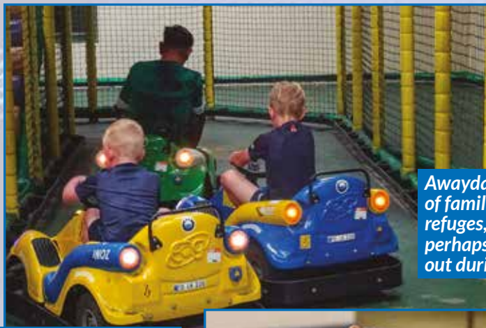
Awaydays for groups of families from refuges, and refugees - perhaps their only day out during the holiday